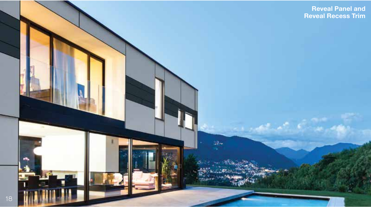
Reveal Panel and Reveal Recess Trim