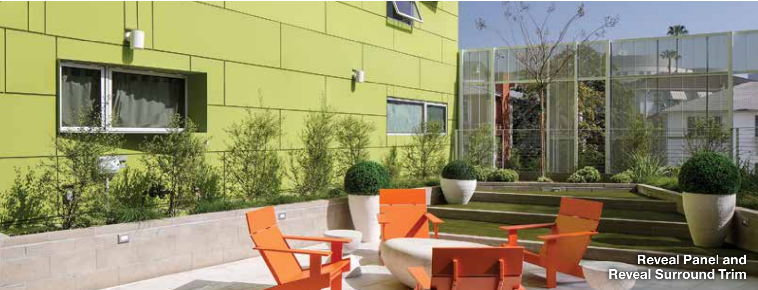
Reveal Panel and Reveal Surround Trim

Customizable system allows you to mix and match compatible components.