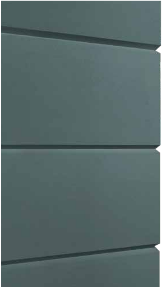
Artisan V-Groove Siding