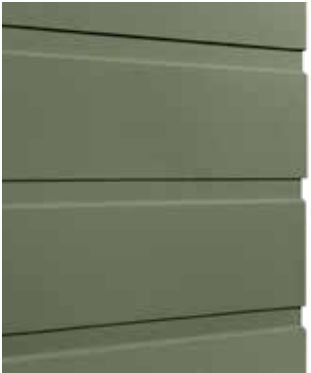
Artisan Bevel Channel