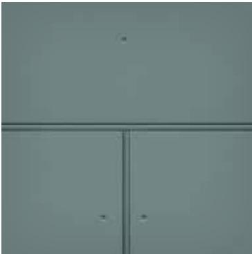
Reveal Exposed Fasteners