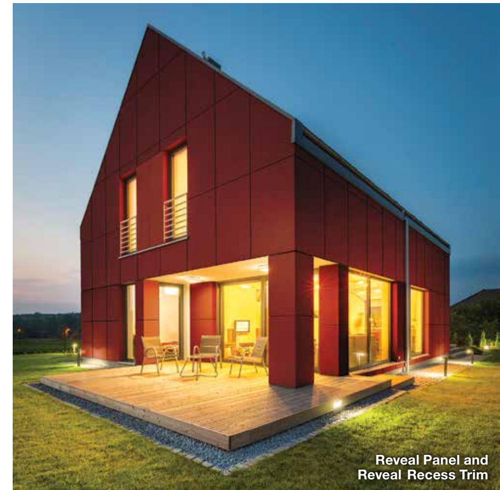
Reveal Panel and Reveal Recess Trim

The Reveal® Panel System expands modern design options with smooth, thick panels plus multiple trim and fastener products.