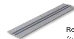
Reveal Recess Trim Available primed