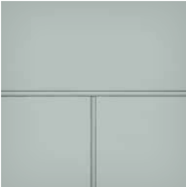
Reveal Recess Trim