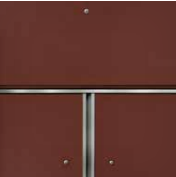
Reveal Surround Trim