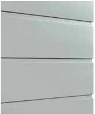
Artisan Square Channel