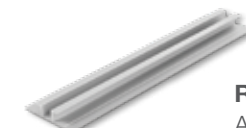
Reveal Surround Trim Available primed in clear anodized finish or with ColorPlus® Technology finishes**