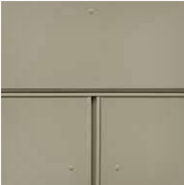
Reveal Surround Trim