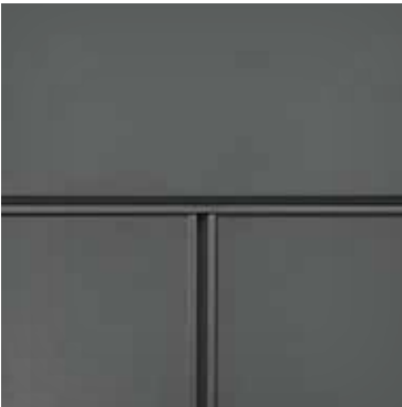
Reveal Countersunk Fasteners

Customizable system allows you to mix and match compatible components.