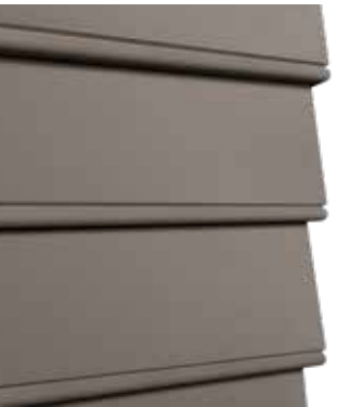
Artisan Beaded Lap