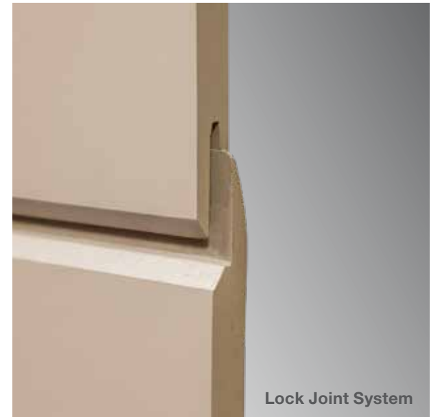
Lock Joint System

add sophistication to your design and can be crafted on-site with any Artisan® profile.